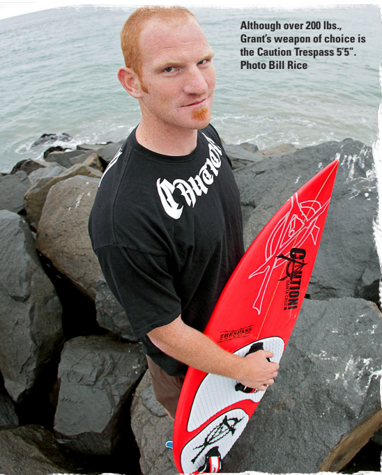
Although over 200 lbs., Grant's weapon of choice is the Caution Trespass 5'5".